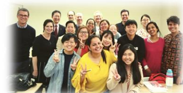
First cohort of students and faculty members of SIPS