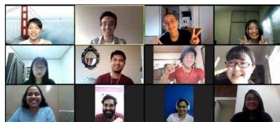
Online student exchange with St. Stephen's College, University of Delhi