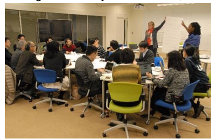
〈 Short-term FD program on campus 〉

In fiscal 2014, we sent 1 faculty to Teachers College, Columbia University for one semester, and held specialized classes to the local students in English. In addition, for the purpose of improving their skills in teaching to non-English students, we conducted a short-term FD program on campus in which we invited two lecturers from the University of Southern California, and 17 faculty participated in the program.