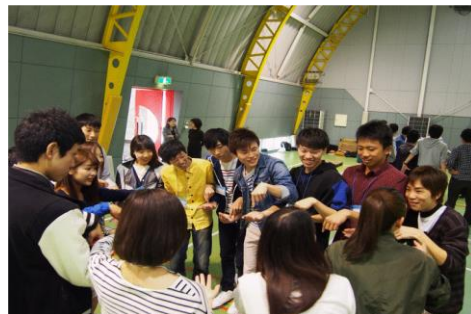
Project adventure study session of Active Learning

Established in year 2000, Center for Excellence in Teaching and Learning has took the lead in promoting collaborative learning and FD programs at Soka University. The achievements being acknowledged, Soka University was selected for the AP Project in fiscal 2014. In this AP Project, we will enrich the quality of our active learning, and through visualizing the achievements and putting efforts in the assessment process, we will implement active learning in 80% of the entire courses. All students will then register for at least 4 classes that implement active learning. With the campus-wide development of active learning, Active learning style such as "Learning Through Discussion (LTD)" and "Project Based Learning (PBL)" have been promoted campus-wide. This has improved the international competency of the bachelor's degree program at Soka University.