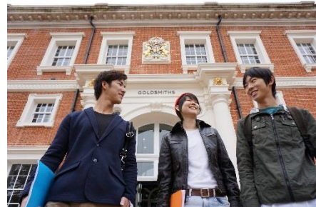
〈 Students of Faculty of International Liberal Arts studying at London University, Goldsmiths 〉

We aim to increase the number of students with overseas experience to 80% of the entire undergraduate students, and students earning credits in overseas universities to 1260 students by fiscal 2023. In fiscal 2014 there were 933 students studying abroad, which includes 78 students in the Faculty of International Liberal Arts (FILA), a newly established faculty where students can graduate by only taking lectures in English. FILA students study abroad for one year from their second semester to four universities in the U.S., U.K., Canada, and Australia, and about 20 students study at each destination respectively. From this fall semester, they are scheduled to take specialized courses in English.