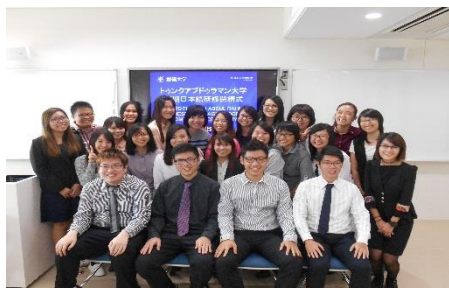
〈 Participants of Japanese language and culture study program from Malaysia 〉

Japan Studies Center improved the learning environment by increasing the number of Japanese Language Courses from 5 to 6 by adding a beginner level course in response to the increase of international students. In addition, we offered the Japanese Language and Culture program as requested by our partner universities. In fiscal 2014, we welcomed international students from four universities in China, South Korea, Malaysia, and Singapore. From this summer, we will launch the same program open for public, and we are scheduled to have 25 participants.